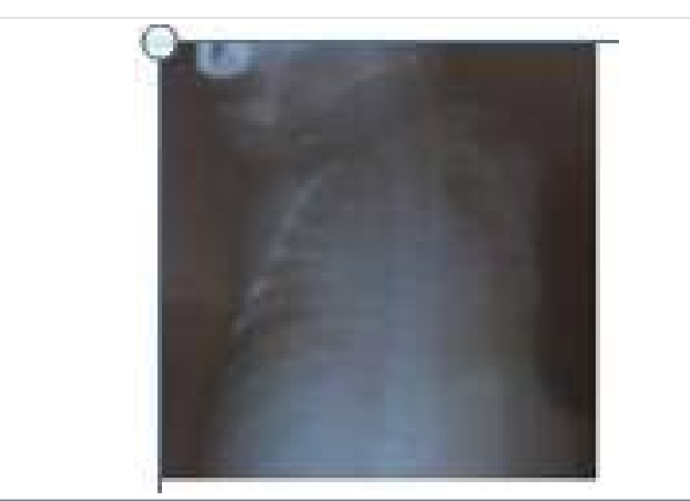
Figure 1: Chest X-Ray showing massive cardiomegaly (CTR = 68%)