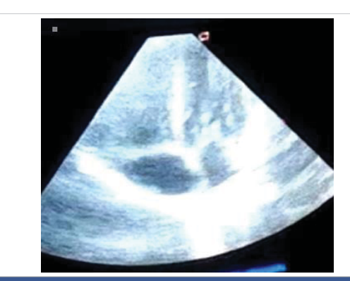
Figure 4: Repeat Echocardiography at 6 weeks of life (apical 4 chamber view) showing significant improvement in ventricular wall and septal enlargement.