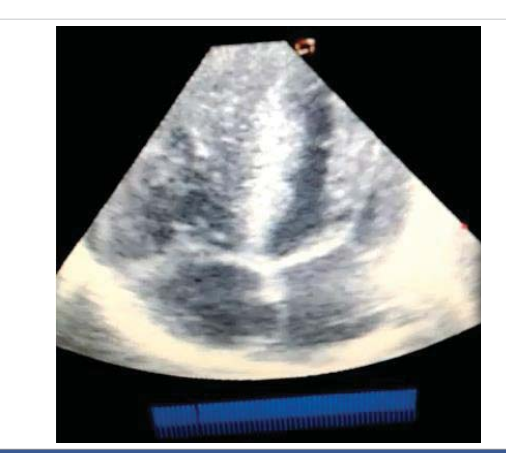
Figure 3: Echocardiography (apical 4 chamber view) showing severe biventricular and septal hypertrophy causing left ventricular outflow tract obstruction and a markedly diminished left ventricular cavity